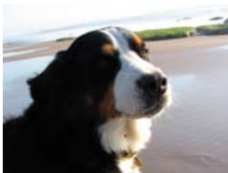
Gherkin on the Oregon coast